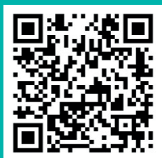
Primary healthcare for Persons with disabilities

Read the Brazilian Inclusion Law (Law 13,146/2015) and access our series of guides using the QR codes below: