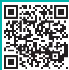
Educommunication - healthcare for Persons with disabilities

If you witness discrimination due to disability, report it! DIAL 100!